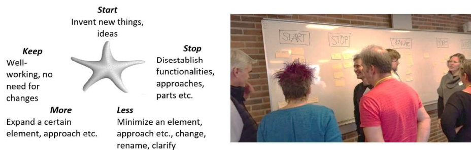
Figure 2: Teachers' feedback on ROBODidactics during a network meeting, according to the Starfish Diagram (method used in Agile Software Development)

Systematic evaluations of the developing versions of ROBODidactics were part of an iterative process in six didactic workshops. In addition, uninvolved teachers' feedback on the model was collected and processed. Among other methods, the "Starfish Diagram" (inspired from Agile Software Development) was used in cross-organizational workshops. The teachers identified principles and features to initiate, to stop, to change, to extend or to keep as they were.